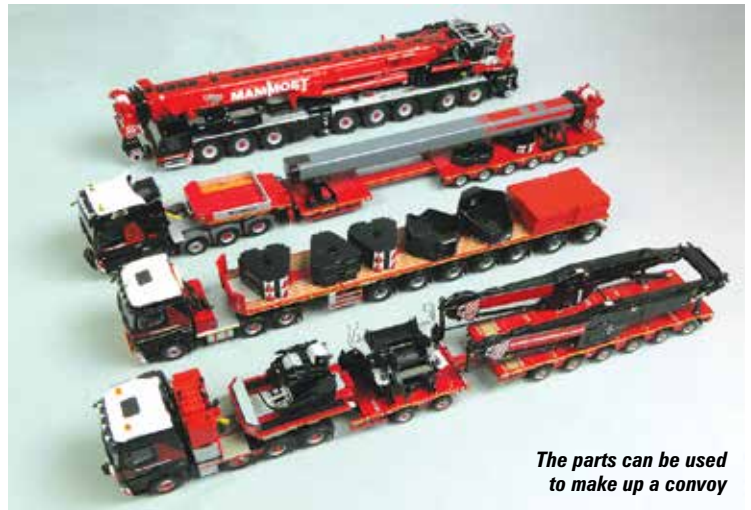
The parts can be used to make up a convoy