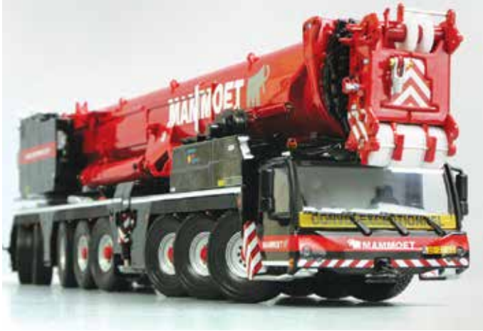
Looks great on the road