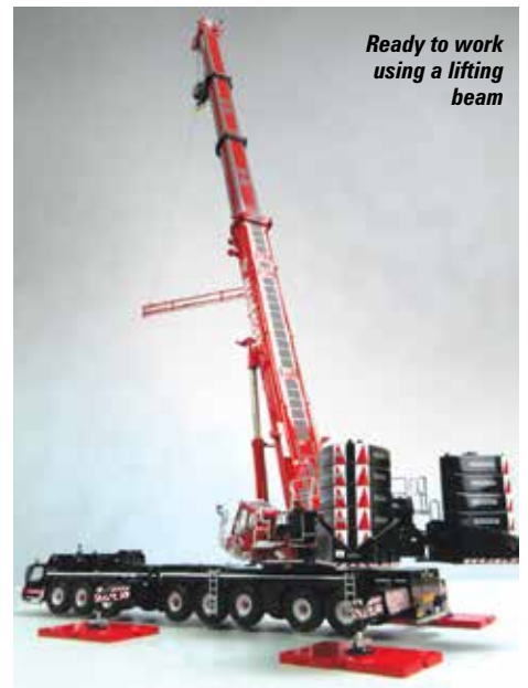
Ready to work using a lifting beam

This is a top quality model which is made well, and the Mammoet paintwork and graphics are generally excellent. It sets a very high standard for a large mobile crane model and costs €589 from the Mammoet Store.